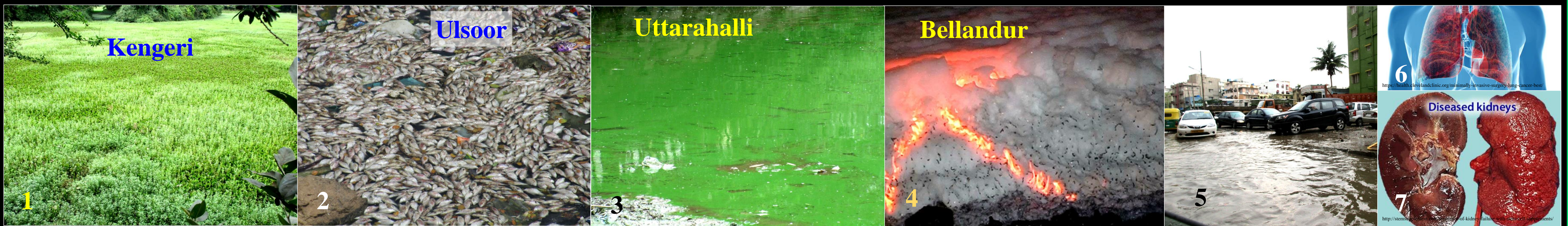
1. Massive growth of Macrophyte; 2. Fish death; 3. Profuse growth of Algae; 4. Foam and Fire; 5. Urban Flooding; 6. Lung cancer; 7. Kidney failure